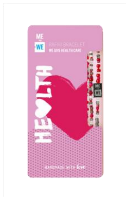
MAKE AN IMPACT RAFIKI - HEALTH