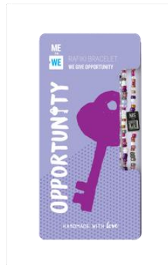
MAKE AN IMPACT RAFIKI - OPPORTUNITY