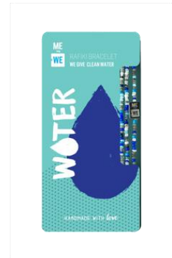
MAKE AN IMPACT RAFIKI - WATER