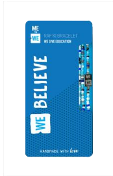
MAKE AN IMPACT RAFIKI - WE BELIEVE

Total Number of bracelets ordered: _____ Total amount of money: $ _____