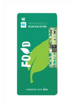
MAKE AN IMPACT RAFIKI - FOOD